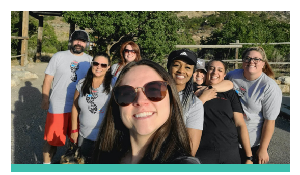
LatinX's Run for The Young Center (Ogden, UT)

WEX Vets convenes the WEX community of veteran professionals and military family members to engage, mentor and empower one another through interactions with leaders and recruitment, and social and professional development programming.