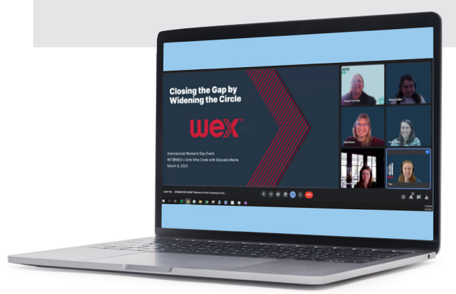
Women in Tech + Girls Who Code International Women's Day Virtual Event