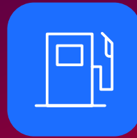
Fuel type and quantity