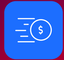
Cost per mile

This level of detail supports better cost analyses, improved vehicle lifecycle management, and streamlined accounting. It also strengthens fraud protection by requiring cardholder input (e.g., vehicle ID) at the pump.